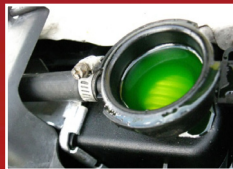
Cooling System treated with Corrosion Inhibitors